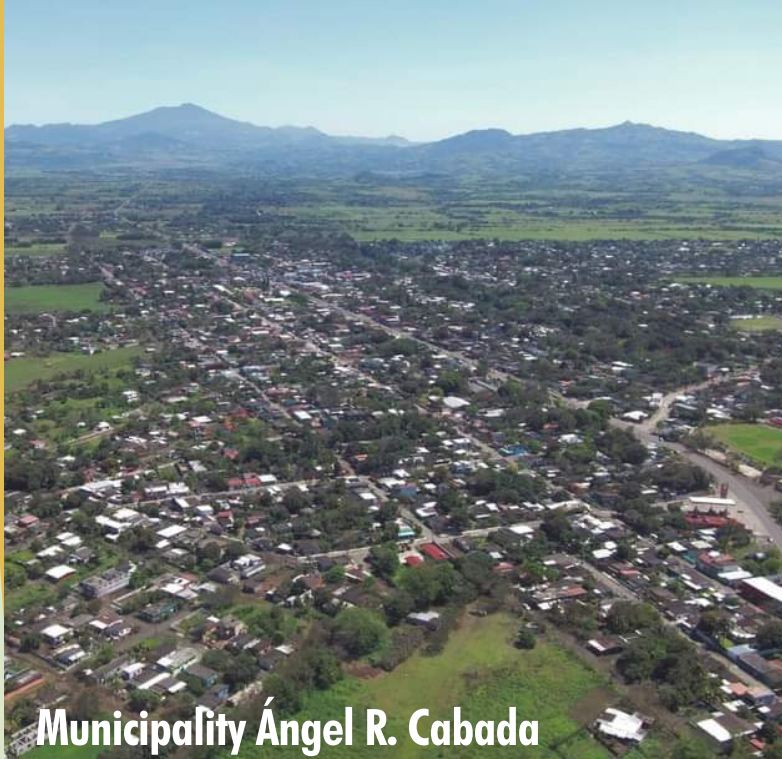
Municipality Ángel R. Cabada